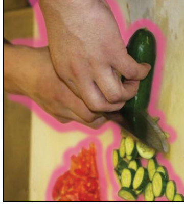
. . . and to the cucumbers . . .