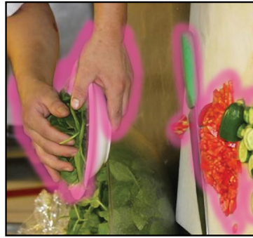
. . . and to the entire salad . . .