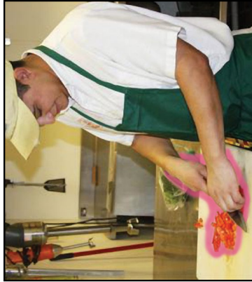
I felt better, so I returned to finish my shift. I needed the money. An order came in for a salad. I forgot to wash my hands or wear gloves.