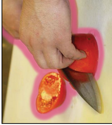
I did not know I had germs on my hands. I passed my germs to the tomatoes . . .